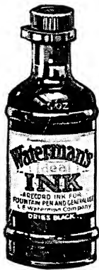
1/2 Pint without Pour-Out. Packed 12 to Carton. Shipping Weight 16 lbs.